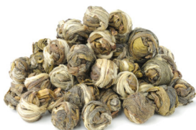
PEARL JASMINE Jasmine Scented Green Tea