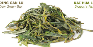
HUANG SHAN MAO FENG Green Tea