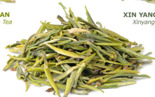
KAI HUA LONG DING Dragon's Pick Green Tea