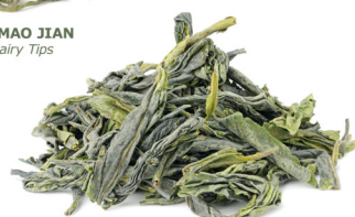
LIU AN GUA PIAN Melon Slice Tea