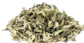
BI LUO CHUN Green Snail Spring Tea