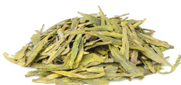
LONG JING Dragon Well Green Tea

Shuijiao (pasta-like dough wrapped round pork meat, chives and onions, similar in idea to Italian ravioli; these can be bought by the jin (pound) in street markets and small eating houses, and make a good snack)