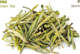
AN JI BAI PIAN An Ji White Slice Tea