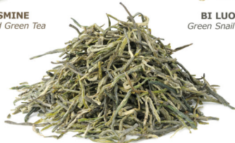
XIN YANG MAO JIAN Xinyang Hairy Tips